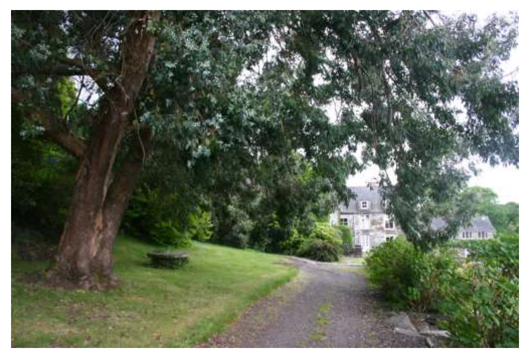
Under Tree At Maes Y Neuadd, Wales