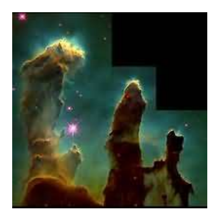
A Nebula creating stars!