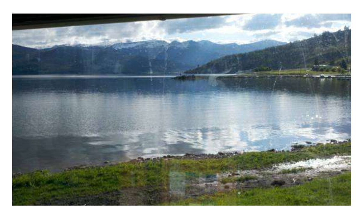
The "still quiet voice" of Majesty was here. Fishing in Lake Hebron, Montanna.