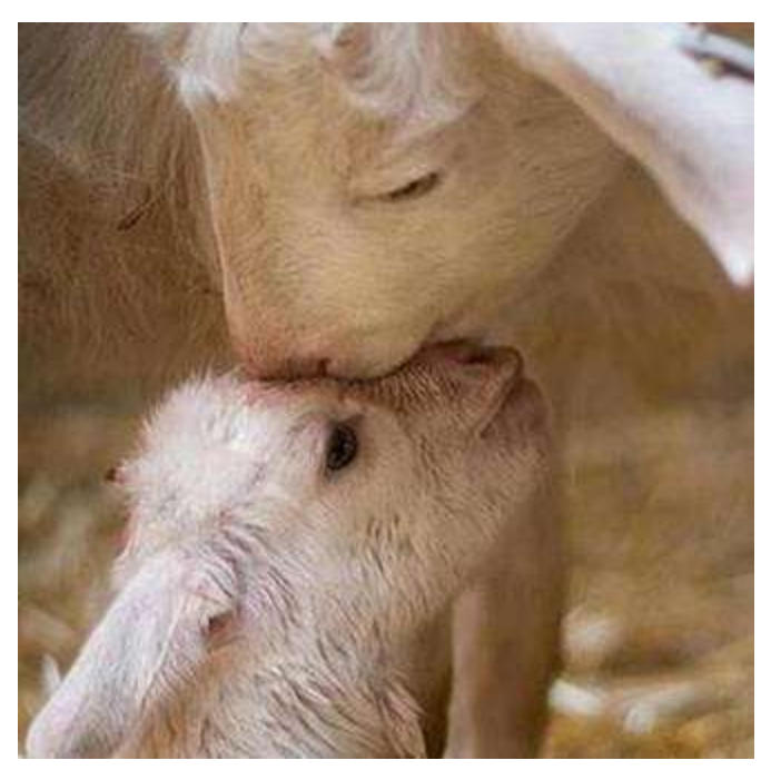
Amazing Photos - A Love expressed