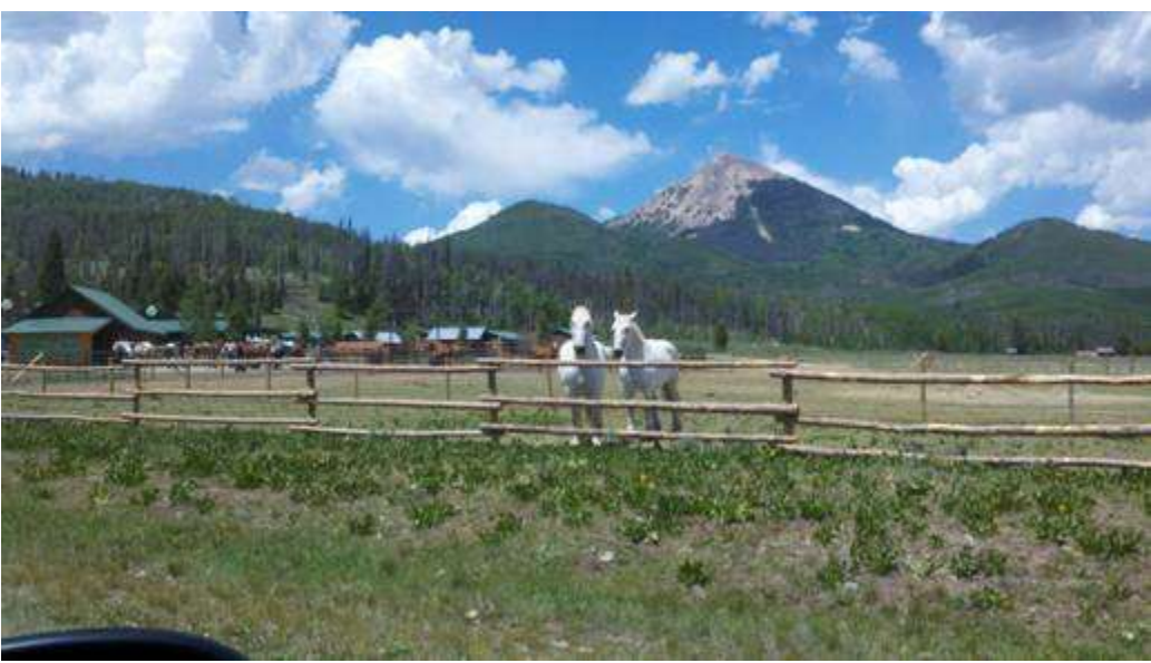
2012 Colorado Even animals are affected by His Majesty.