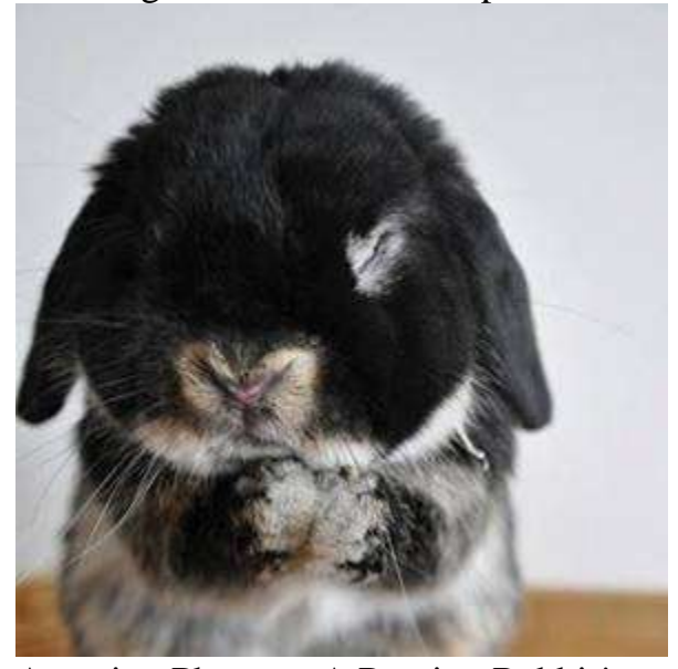
Amazing Photos – A Praying Rabbit!