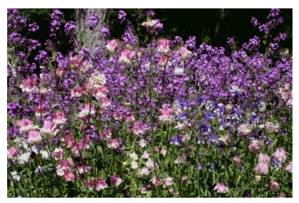
G.W.P. Photo of Dames Rocket

"For you were once darkness, but now are you Light in the Lord; walk as children of Light," Eph.5:8.