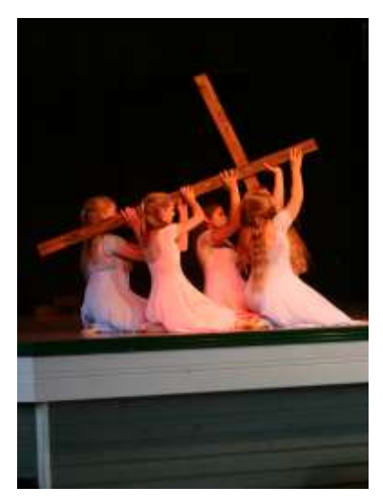
G.W.P.Photos Teens dancing