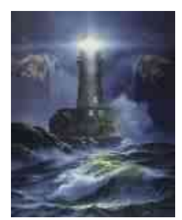
I AM The Light by Hohlbohm

"...When the enemy shall come in like a flood, the Spirit of the Lord shall lift up a standard (Jesus) against him," Isa.59:19.